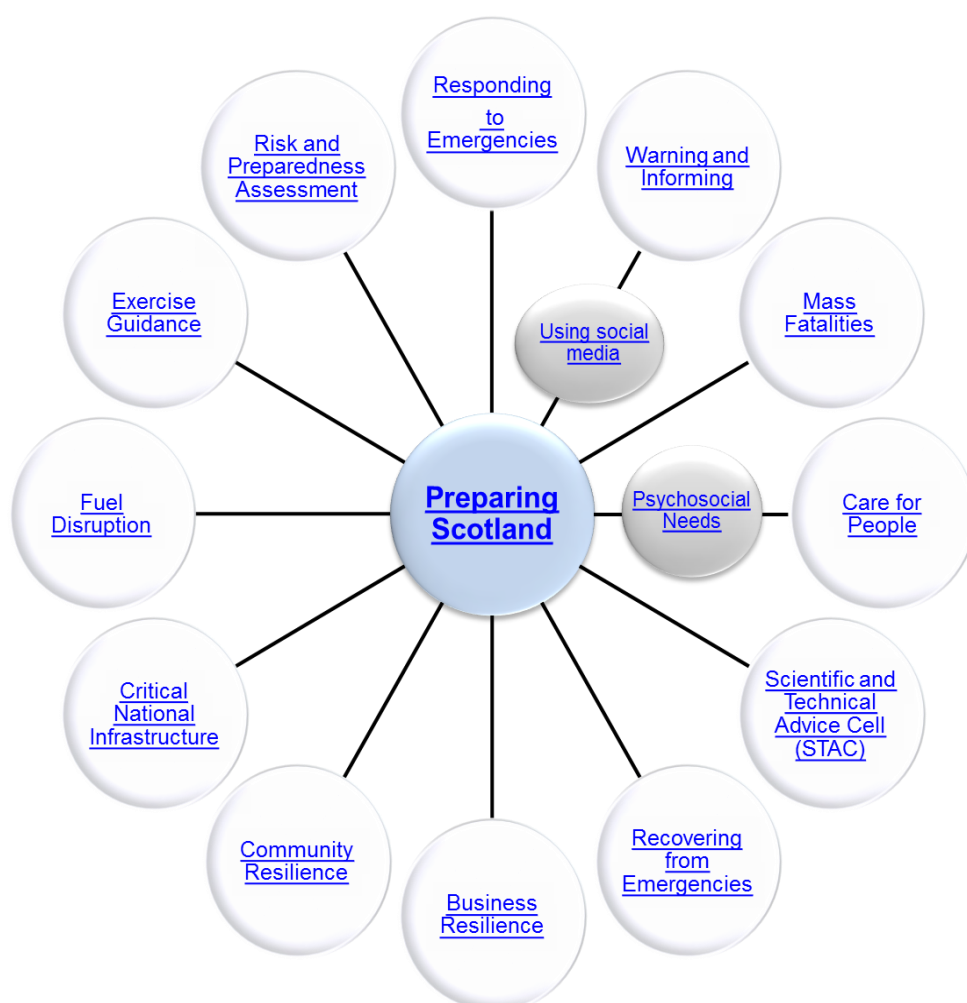
"Hub and Spokes" MODEL

Users who are familiar with the structures and processes of resilience in Scotland may use this Responding to Emergencies guidance in isolation. For those unfamiliar with these structures it is recommended that this guidance is read in conjunction with the central hub, Preparing Scotland.